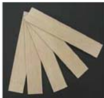
Natural materials (Ramie/starch)